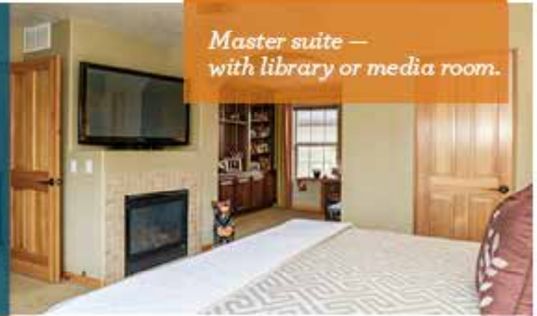
Master suite — with library or media room.